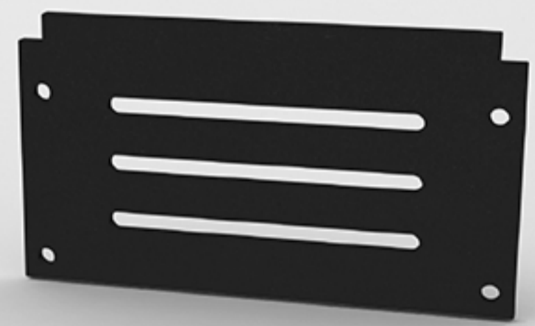
(side cover with vents)

Effective thermal management is key to realizing the advantages of LED lighting. The operating temperature of the LED largely impacts the lighting color and the overall lifetime.